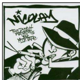
Dutch Masters Mixtape Volume 1