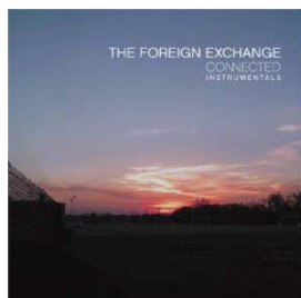
The Foreign Exchange – Connected Instrumental